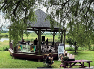
Supporting local causes