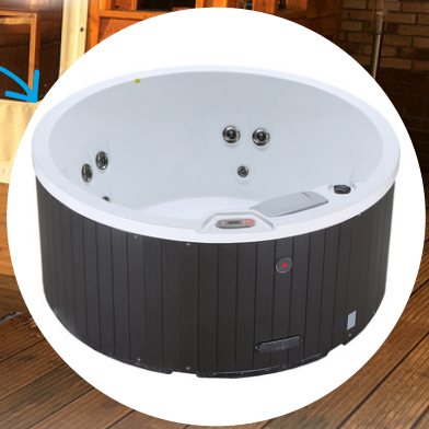
OKANAGAN 4 PERSON HOT TUB