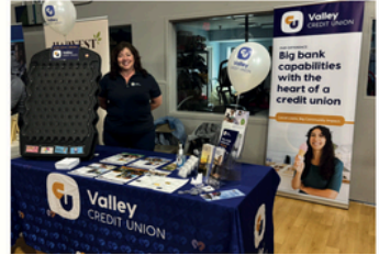
Giving back to our community

Thinking about renovating? Let your money work for you and your community. Banking that goes further.