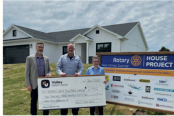
Proudly built in the Valley